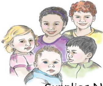
Supplies Needed for children

Visit www.gracechurchsc.org/FAresourcecenter for more information